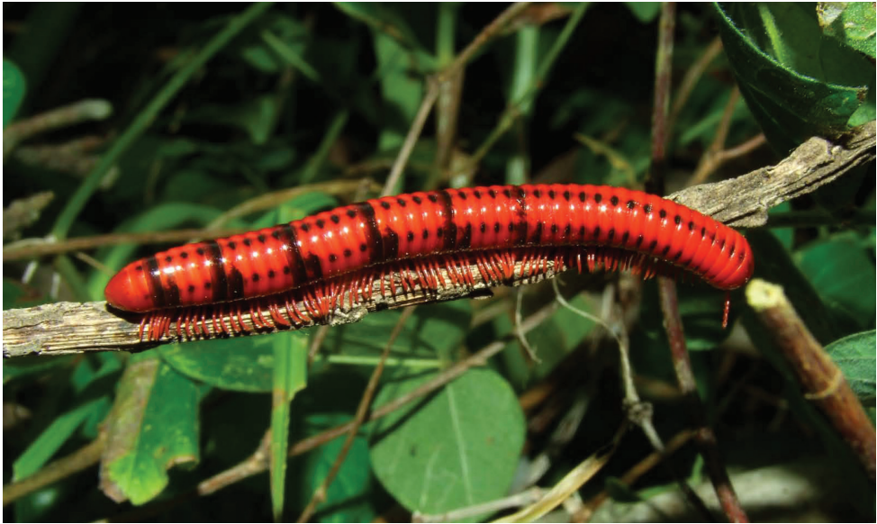
Figure 1. Centrobolus vastus var. sexfasciatus at Port. St. Johns, Eastern Cape, South Africa. See also http://www.flickr.com/photos/46608040@N04/5261677348/ (under C. fulgidus).

served in C. vastus var. sexfasciatus . This series of anamorphic stadia resembles what one sees in other spirobolidans in terms of body ring increments between stadia (Table 2). If the podous body ring numbers in this sequence (21, 26, 31, 36, 40) are plotted on an adult specimen (Fig. 2) it is seen that these podous rings are all just in front of one of the transverse black bands. It would therefore seem that the black bands are formed in connection with anamorphic moults and that they occupy the first two of the newly formed podous body rings.