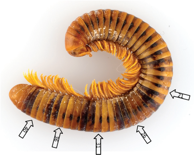
Figure 2. Centrobolus vastus var. sexfasciatus , female from Port. St. Johns, Eastern Cape, South Africa, date?, M. Boddely leg. (MRAC). The arrows point at the body rings which are the posteriormost podous rings in the inferred anamorphic stadia. Length of specimen 60 mm.