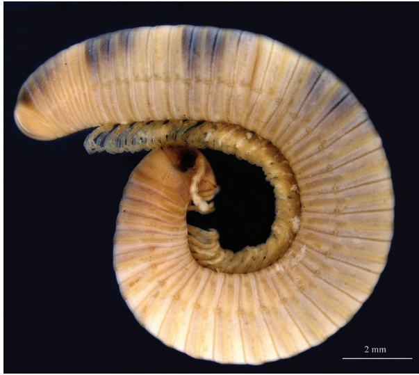
Figure 4. Sagmatostreptus strongylopygus , anamorphic juvenile from Amani, E Usambara Mts., Tanzania, 26 July 1974, I.B. Enghoff & H. Enghoff leg. (ZMUC), 34 podous + 5 apodous rings, 5 rows of ocelli. N. Akkari phot. Scale 2 mm.

rows can be discerned at all, there are at least 11 rows in specimens with 45+ podous rings although just 7 would have been expected in a specimen with 45 podous rings if S. strongylopygus followed the normal pattern of ocellar increments. (Maybe S. strongylopygus which leads a comparatively overt life, cf. Hoffman and Enghoff 2011, has particularly strongly developed eyes, hence the ‘supernumerary’ rows.)