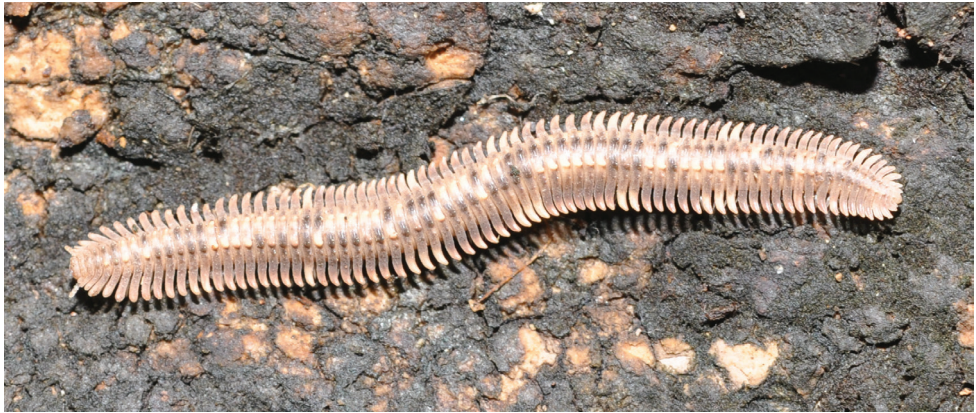
Figure 7. Unidentified platydesmid from Malaysia.