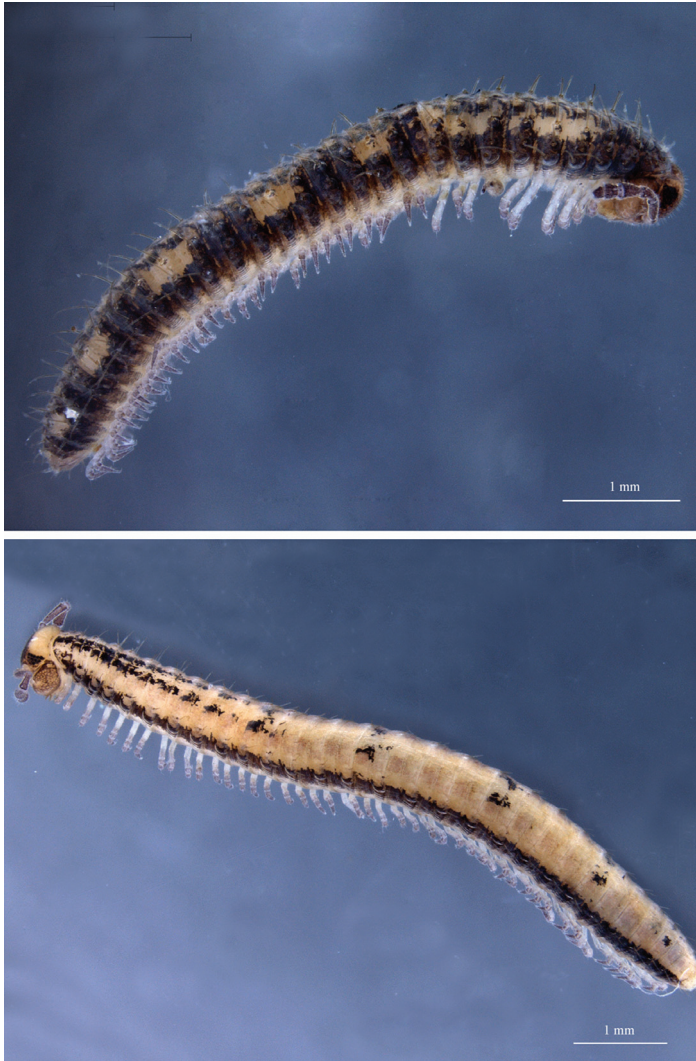
Figure 10. Two species of unidentified Chordeumatida from New Zealand (A. Solodovnikov & L. Vilhelmsen leg., ZMUC). Top: subadult male from South Island, Fiordland/Otago District, Lake Gunn, 44°51.500 S, 168°06.086 E, 500 masl, mixed conifer/broadleaf/beech forest, sifted leaf litter, 25.i.2011. Bottom: subadult female from South Island, Fiordland District, W slopes of Mt. Burns (W of Monowai), 45°44.808 S, 167°23.109 E, 900–950 masl, beech forest, in leaf litter and under logs, 23.i.2011. N. Akkari phot. Scales 1 mm.