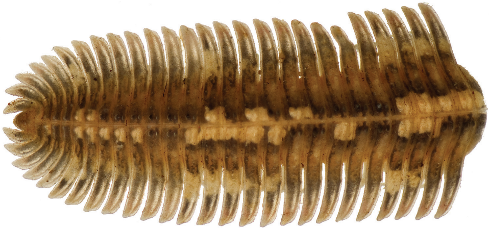
Figure 8. Pseudodesmus cf. variegatus from LAOS, Vientiane Prov., Phou Khao Khouay, N 18, 20,369', E 102, 48,523', 7–800 m, 28–31.v.2008, A. Solodovnikov & J. Pedersen leg. ( ZMUC), posterior part of body. Length of fragment 23 mm.

< 55 pleurotergites, which are generally much paler, no lateral spots are visible, but the irregular distribution of black and white tubercular spots is clear. Limits between pleurotergite series on these specimens were identified by locating the posterior limit of (series of) double white tubercular spots.