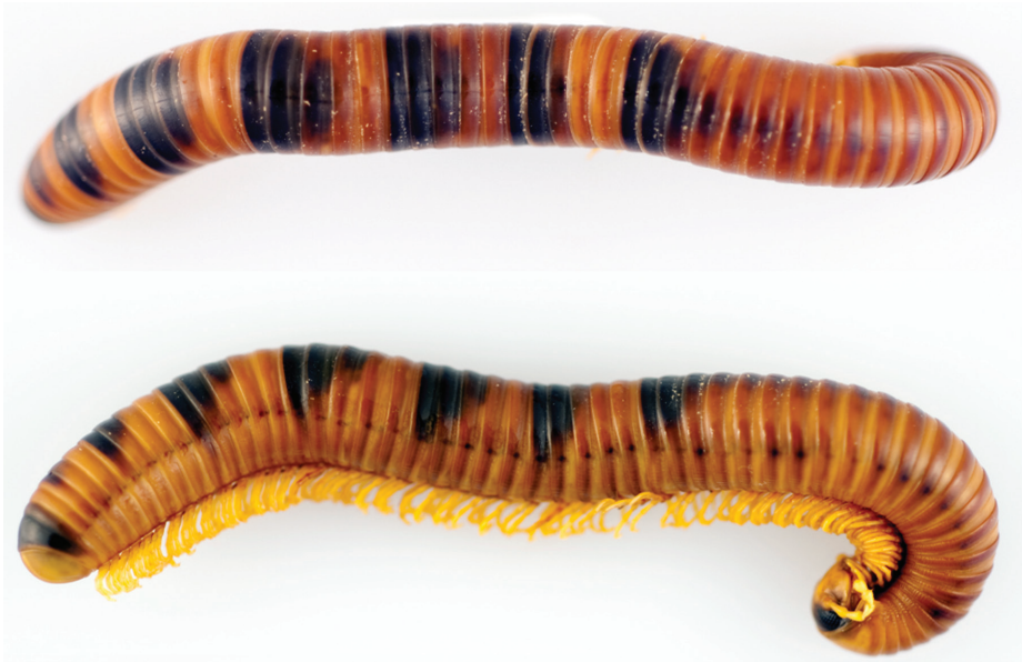
Figure 3. Sagmatostreptus strongylopygus , subadult female from Amani, E Usambara Mts., Tanzania, 11 April 1985, T.G. Nielsen leg. (ZMUC), dorsal and lateral views. Length of specimen 117 mm.